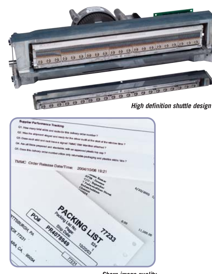
Sharp image quality

The nominal print density for these printers is 180x180 dots per inch (DPI). Alternately, 120x120 and 90x180 DPI modes are available when image detail can be traded for speed. The printers incorporate special fine tip technology to produce much smaller dots than the standard P7000. All of this is driven by the P7000's PSA3 controller, which provides the necessary power to drive these complex graphics at full speed. The result is the sharpest highest quality image ever produced by Printronix.