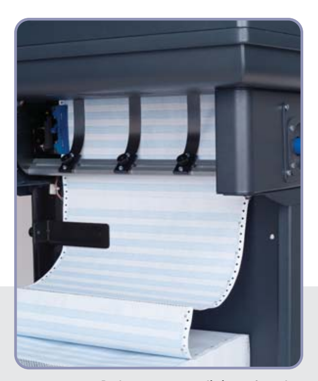
Push tractor system eliminates forms loss