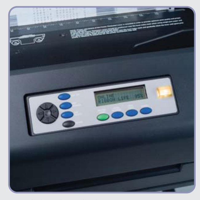
Plan print jobs with precise ribbon life indicated on panel

Special formulation and larger capacity spool delivers higher performance and lower cost